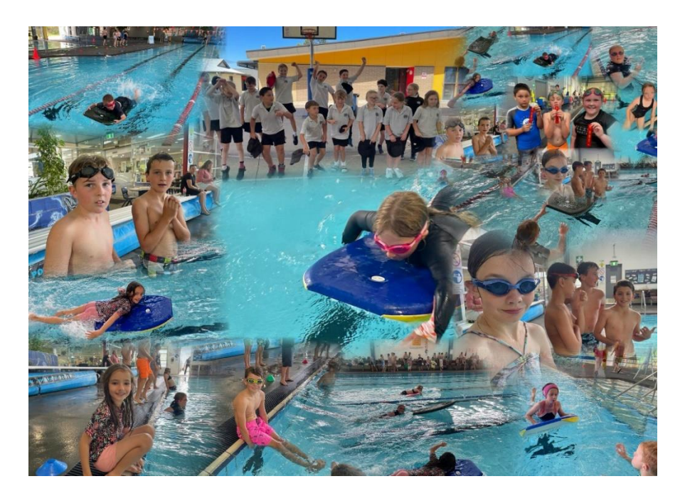
TAPS students at our school swimming carnival.

Schools have considerable flexibility in the design of their teaching and learning programs. At TAPS we focus on Literacy, Numeracy, Visual Arts, L.O.T.E (French) and Physical Education, on a weekly basis. Other subjects such as Science, Geography, Civics & Citizenship, Economics, Music, Dance Drama and History are taught through Integrated Studies units across all year levels biannually.