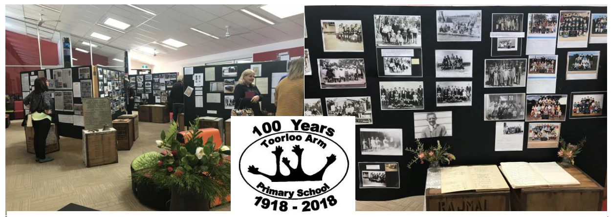
TAPS celebrated 100 years in 2018 with centenary celebrations and displays of our school history.

We have an undercover area to keep bikes and scooters out of the weather.