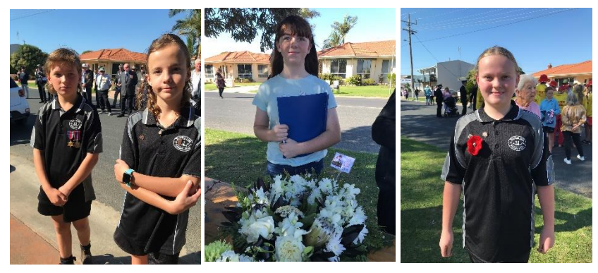
Students represent our school at assembly and community events.

Grade 6 students attend the annual Big Day Out at Lakes Entrance main beach.