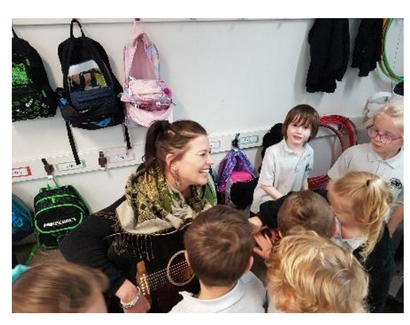
We encourage parent participation in classroom activities.