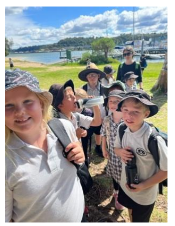
Grade 1&2 students enjoyed a History excursion to the New Works Lakes Entrance