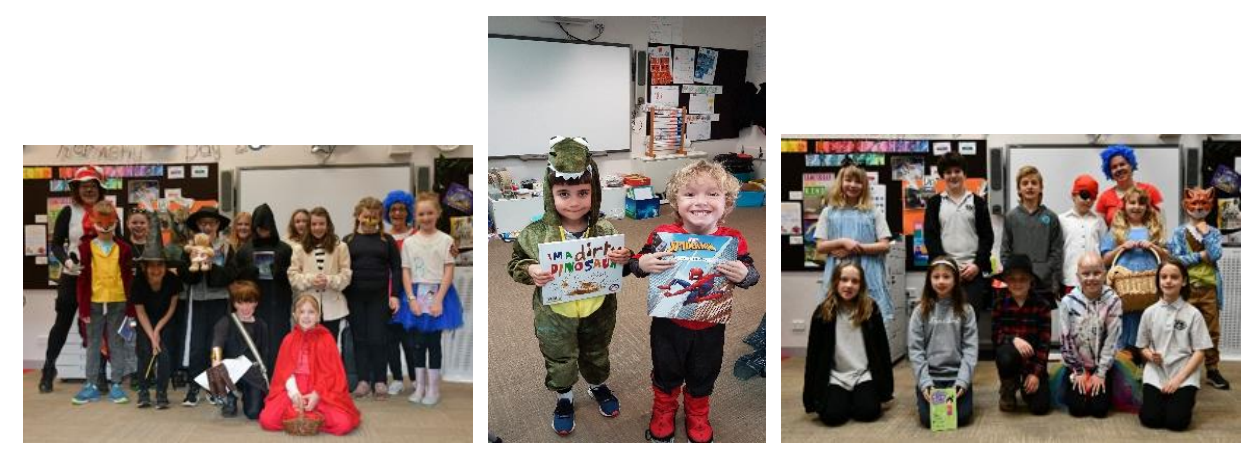
Students and staff celebrating book week.

Children should not be enrolled at another school without an official transfer note. It is important that school records are kept up to date. If you intend moving from the school, please notify the school so that necessary reports and transfer notes can be prepared.