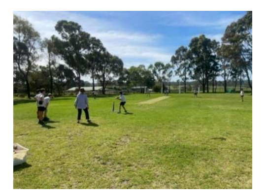
Grade 5&6 afternoon sport