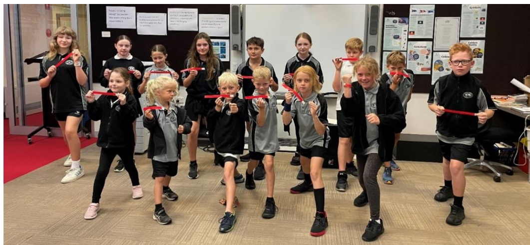
TAPS Lunch time Running Club

SWIMMING: Students participate in swimming lessons at the Lakes Aquadome. The school holds its own Swimming Carnival grade 3 – 6 in Term one.