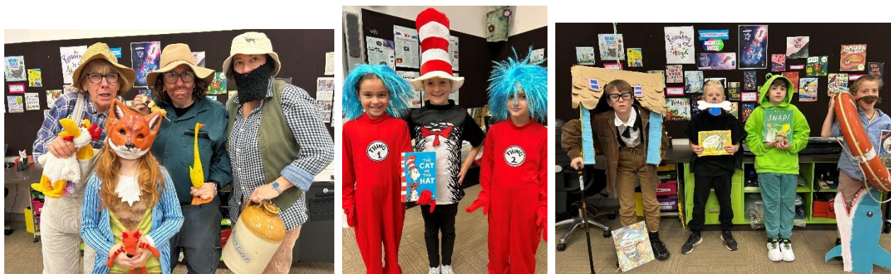
Staff and students celebrating book week.

Children should not be enrolled at another school without an official transfer note. It is important that school records are kept up to date. If you intend moving from the school, please notify the school so that necessary reports and transfer notes can be prepared.