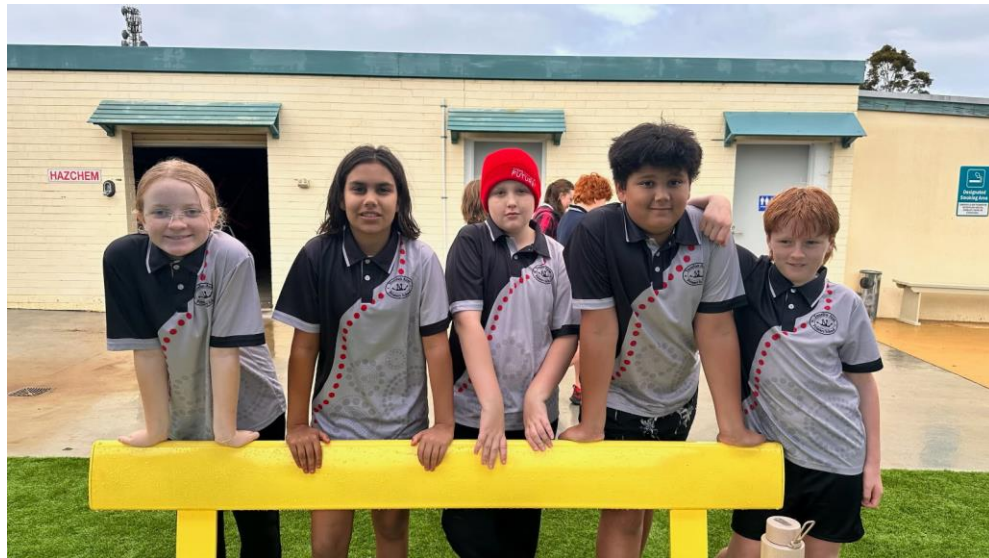
2025 Lawn Bowls team.

Schools have considerable flexibility in the design of their teaching and learning programs. At TAPS we focus on Literacy, Numeracy, Visual Arts, L.O.T.E (French) and Physical Education, on a weekly basis. Other subjects such as Science, Geography, Civics & Citizenship, Economics, Music, Dance, Drama and History are taught through Integrated Studies units across all year levels biannually.