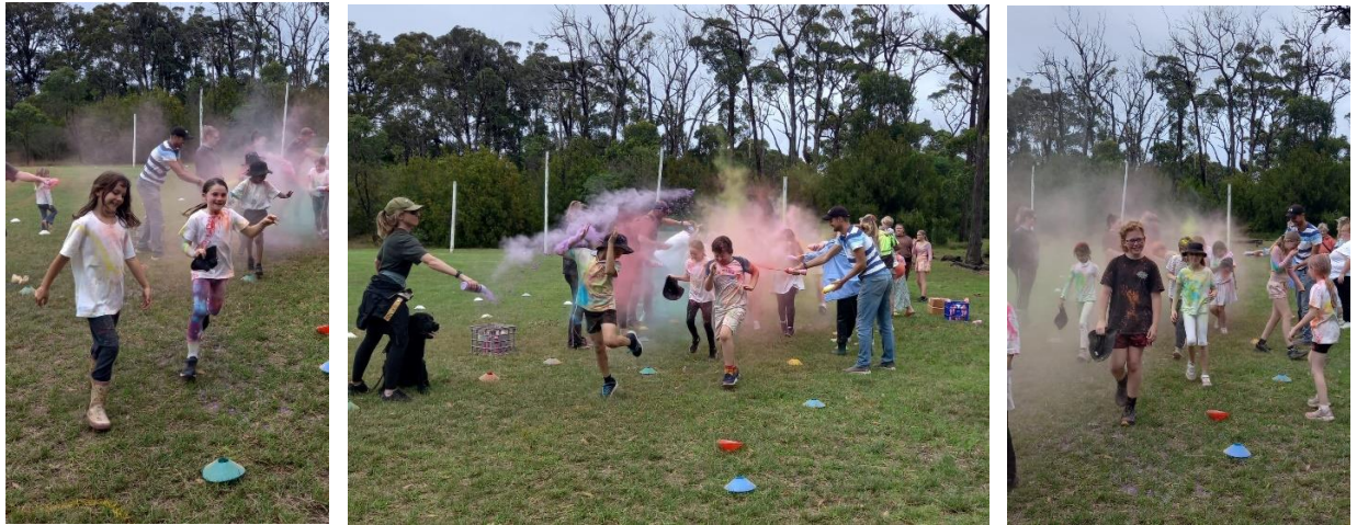
TAPS Colour Run celebrating Harmony week